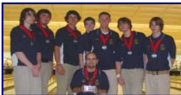
NEW PRAIRIE COUGARS